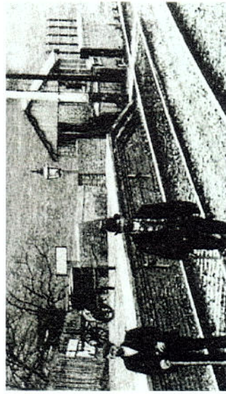
signal box - operated the crossover points and station signals