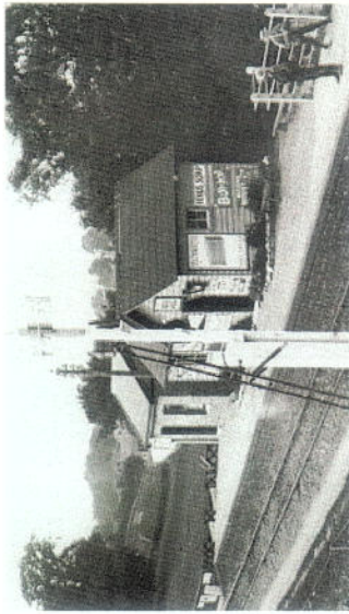
'down' platform - trains for Bailey Gate, Broadstone, Poole and Bournemouth (West)