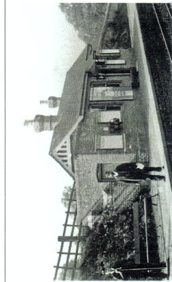
'up' platform - trains for Blandford, Templecombe and Bath (Green Park), also Burnham-on-Sea